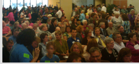
The turnout at the Tacoma meeting, estimated at 450 people

Tuesday in Tacoma marked the first of four stops on the Governor's Transforming Washington's Budget (TWB) tour, stopping also in Everett, Vancouver and Spokane in the coming weeks.